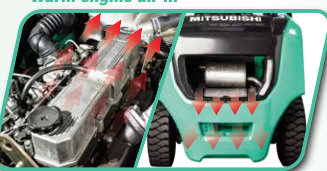
Warm engine air out